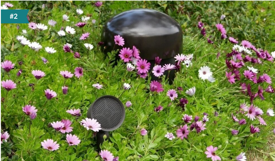
GARDEN SERIES 8.1 SYSTEM + SONANCE AMPLIFIER